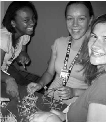
The ladies of Montgomery City create new friendships through their city mixer.